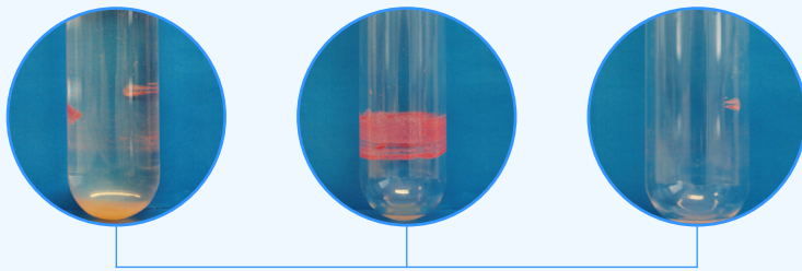
Treated with BEV